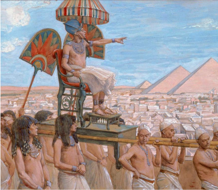
Pharaoh Notes the Importance of the Jewish People. Painting by James Tissot.