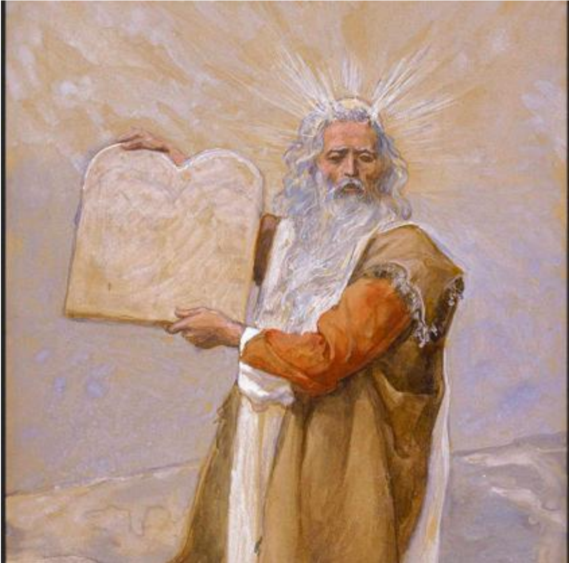
Moses and the Ten Commandments. Painting by James Tissot. Public Domain.